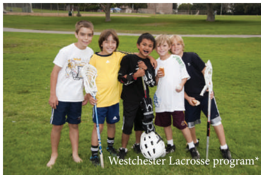
Westchester Lacrosse program*

In the past six years the Department of Recreation and Parks has added 40 parks and over 650 acres of park land.