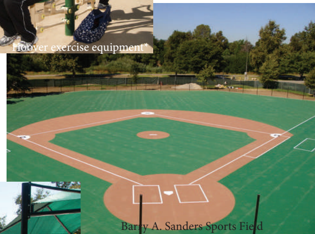
Barry A. Sanders Sports Field