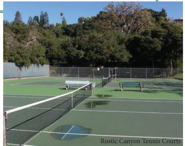
Rustic Canyon Tennis Courts