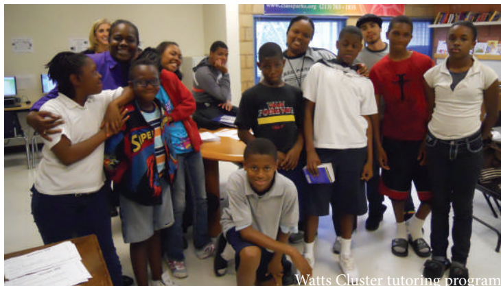
Watts Cluster tutoring program

Continued support of the Mounted Patrol in Griffith Park with funding for a trainer for the horses and the Rangers.