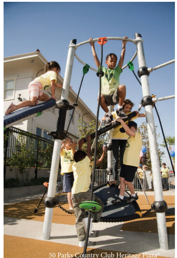
50 Parks Country Club Heritage Plaza*