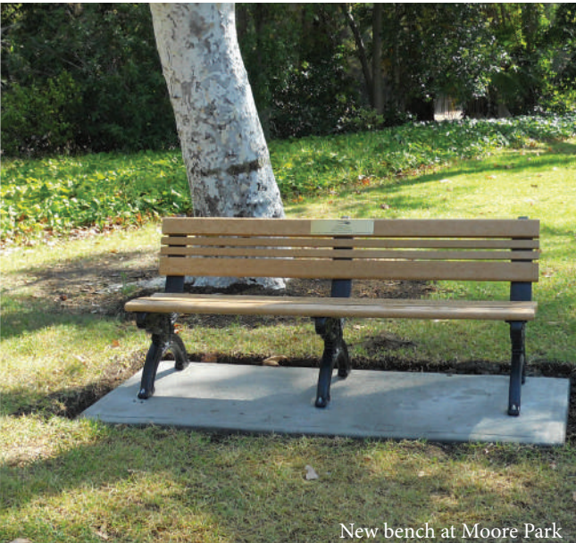
New bench at Moore Park

Each donor has the opportunity to install an inscribed bronze plaque on the bench, many of which honor family and friends. This program has expanded seating areas for rest and reflection with a personal touch.