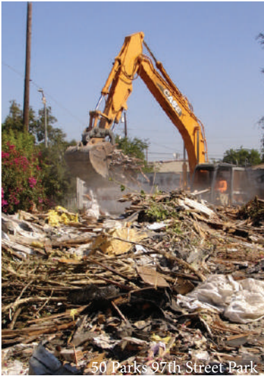
50 Parks 97th Street Park