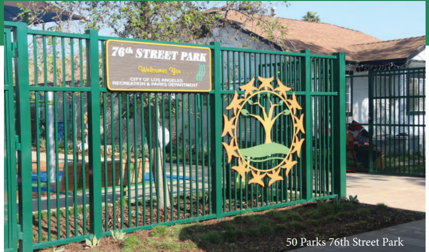
50 Parks 76th Street Park

Through grants from the California Endowment and First 5 LA the LA Parks Foundation has partnered with the city and others to build 4 new parks. These parks are part of a citywide initiative to add more open space to densely populated neighborhoods.