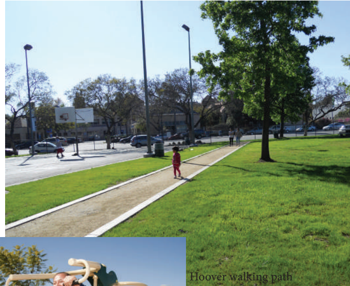
Hoover walking path