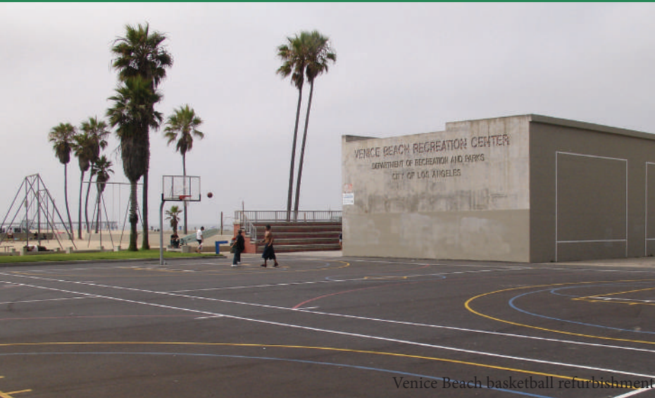
Venice Beach basketball refurbishment

LA City parks offer over 25 all access playgrounds providing special play space for all children.