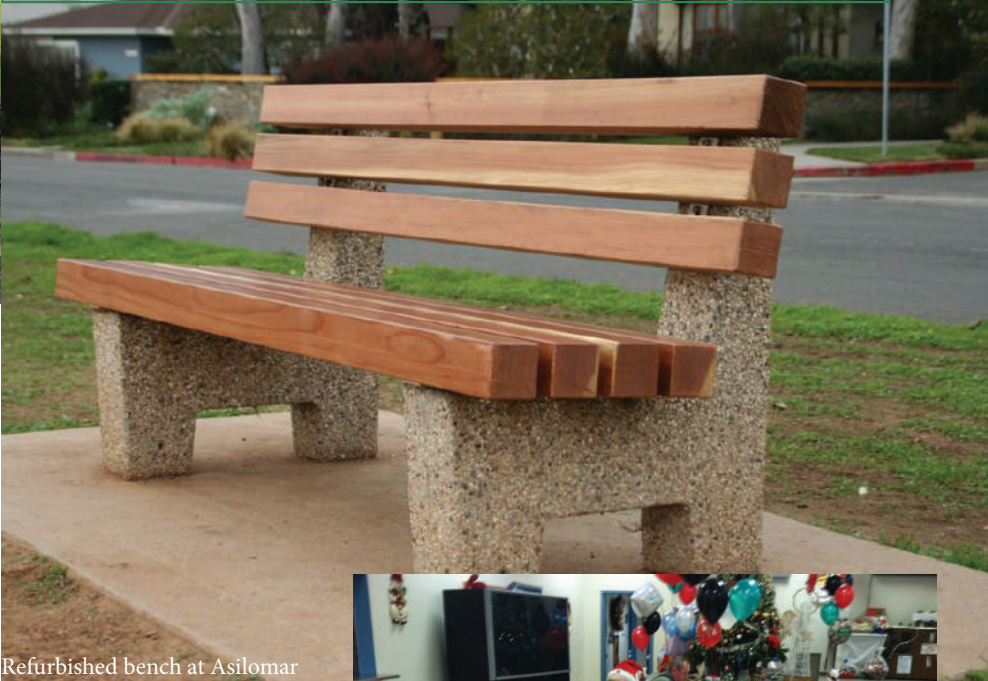
Refurbished bench at Asilomar