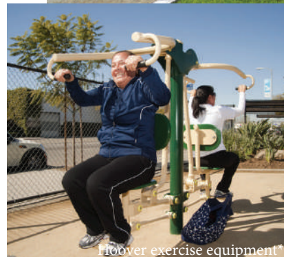
Hoover exercise equipment*