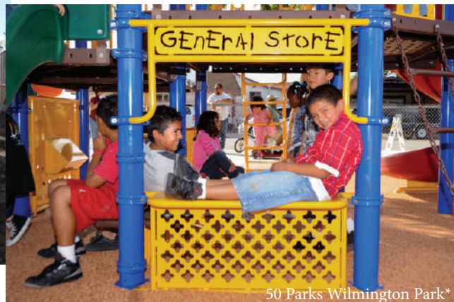
50 Parks Wilmington Park*