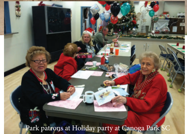
Park patrons at Holiday party at Canoga Park SC

Unspecified Friend donations fund the annual Holiday Grants, which provide extra support for holiday festivities at the recreation centers. The foundation was able to gift 20 parks in need in December, 2012. The grants were primarily used to purchase food and toys that were distributed at park holiday parties.