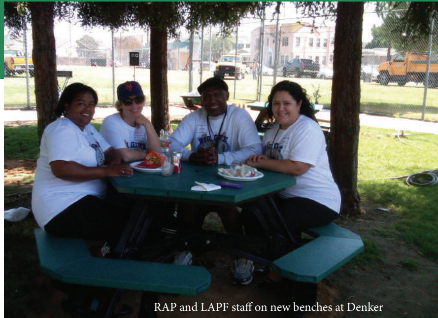
RAP and LAPF staff on new benches at Denker

The Los Angeles Parks Foundation was happy to facilitate all of the 2012 park adoptions. The program, which allows for individual donors and corporations to adopt a park of their choice and make specific park improvements, truly makes a difference. The adoption brings Recreation Center's staff and the community together with the donor to make the very best enhancements to the park in need.