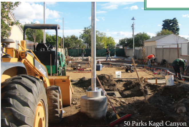
50 Parks Kagel Canyon

76th Street Park, dedicated December 2012, was one of the first to open. Construction was funded by The California Endowment. First 5LA sites at 97th Street, 105th Street and Kagel Canyon Park are all set to open in the beginning of 2013.